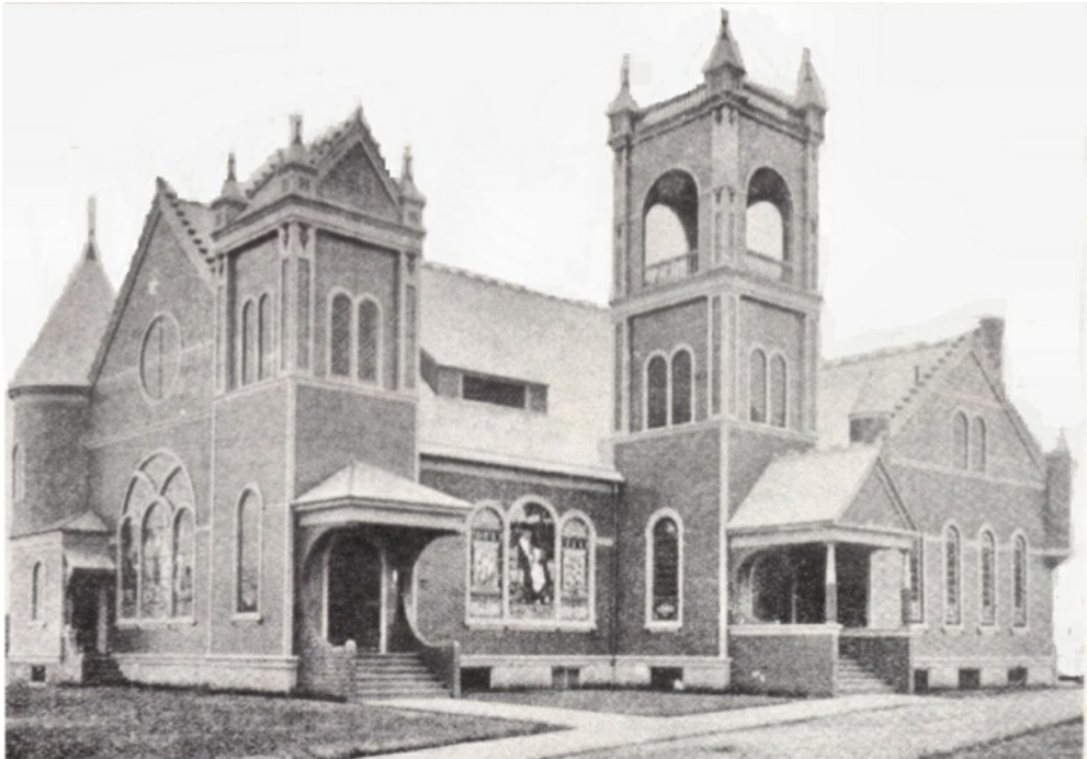
The new building in 1901, two years after completion. The old Meeting House turned 90° is seen on the far right. An olive color, it was a very modern church building.